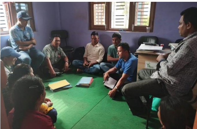
Above: Coop Steering Committee Meeting

Members of the coope executive committee met monthly and discussed their plans for the next month. They discussed conducting the annual audit and also having annual general assembly meeting.