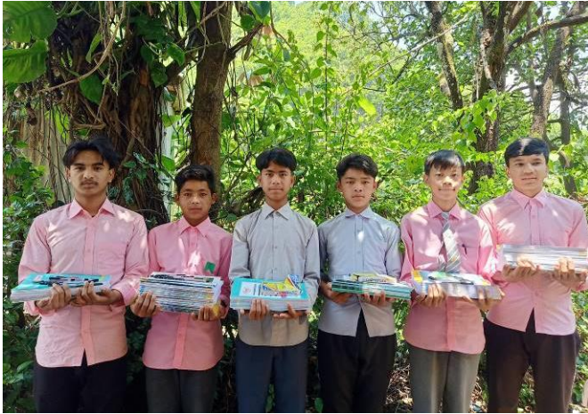
Above: Students with educational materials from Rukmani School