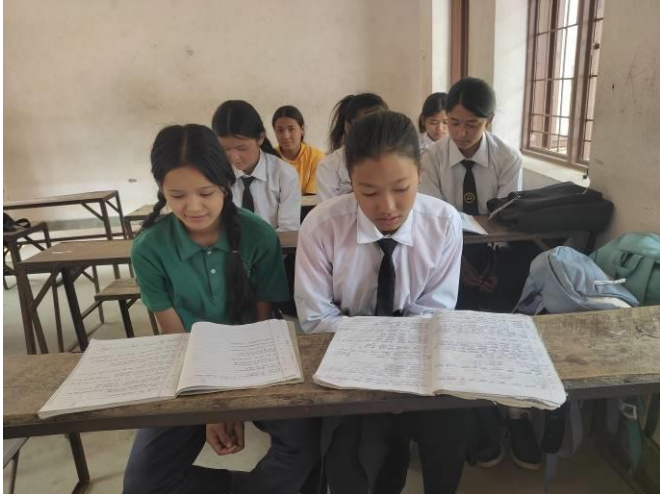
Above: Dupcheshwor School Visit

This quarter we conducted 33 school visits . Through the school visits, we met sponsored children, class teachers, and school principals to monitor our sponsored children's overall performance in terms of their study, school attendance, and participation in extracurricular activities.