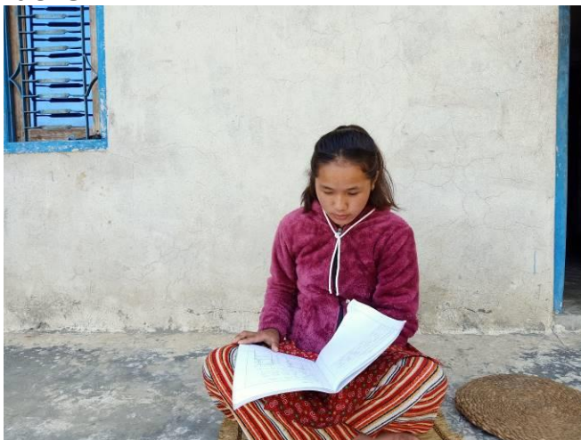
Above: Dolma during home visit