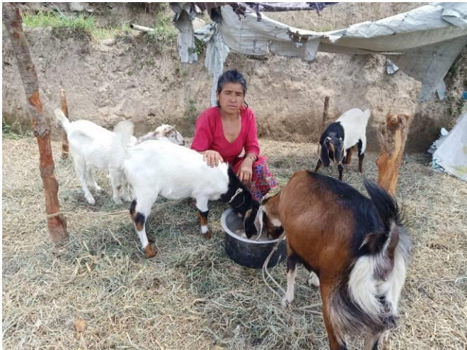
Above: Mother of Laxmi with goats