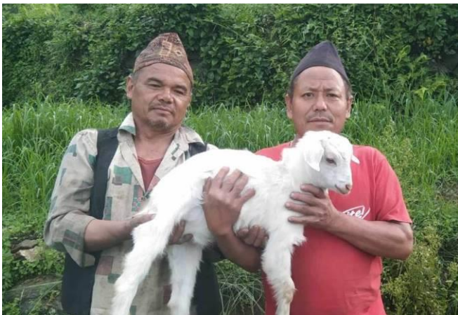
Above: Recent goat handover

There are now 76 households that received 2 goats from the original 18 households. 91 goats have been passed on to other families so far. There are now almost 66 pregnant goats .