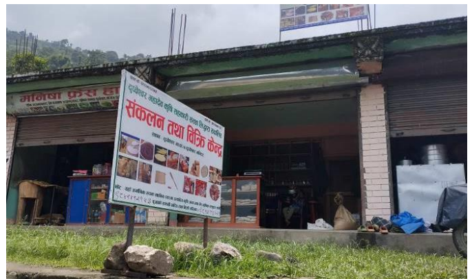
Above: Collection and Selling Center

Dupcheshwor Mahadev Krishi Sahakari (the coop formed by project) established a "Cooperative Collection and Selling Center" at Ramati, Dupcheshwor this quarter. The plan is to collect the products of coop members at the centre and sell them to markets through this centre, providing a link between our farmers and the market. 1 staff is recruited on the percentage basis of profit in this center.