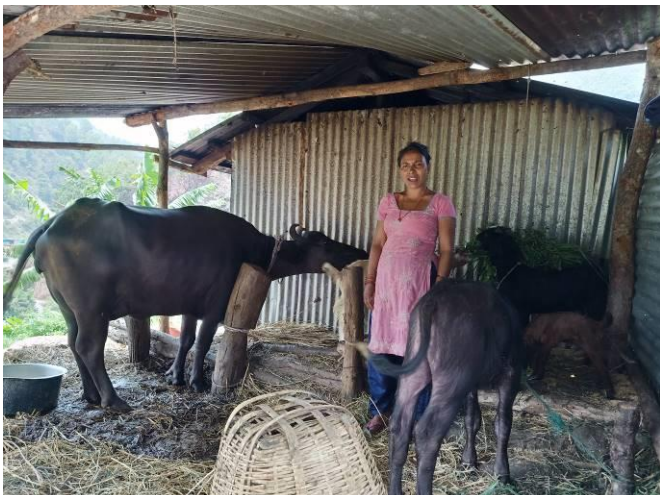
Above: Mother of Sandesh with buffalos