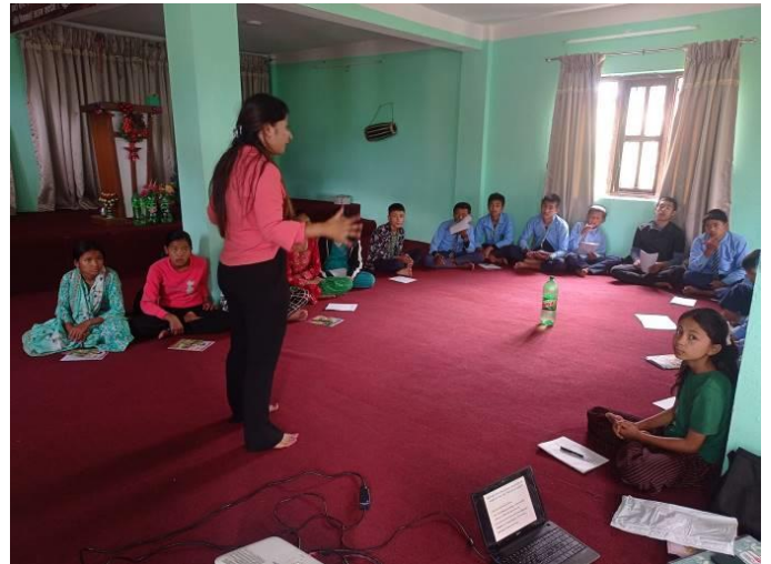
Above: Peer Education Training

19 youth (8 girls and 11 boys) participated from the Betini program. This training was organized with funding of office of the Dupcheshwor Rural Municipality as part of government collaboration with our project and its activities.