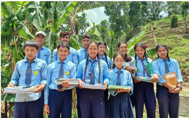
Above: Students of Udaijalpa School with education materials