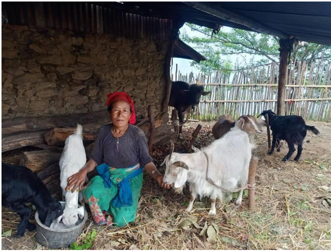
Above: Mother of Babin with goats