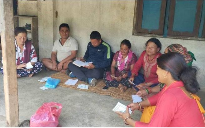
Above: Cooperative Meeting, Kalyan