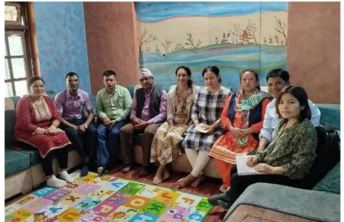
Above: Some of the key member of RMPAC

We presented project updates for the year along with the issue and challenges we faced during implementation for their feedback and the necessary support and collaboration. Government officials from working Rural Municipalities appreciated our work and intervention and committed to working collaboratively for the improvement of the betterment of project as usual.