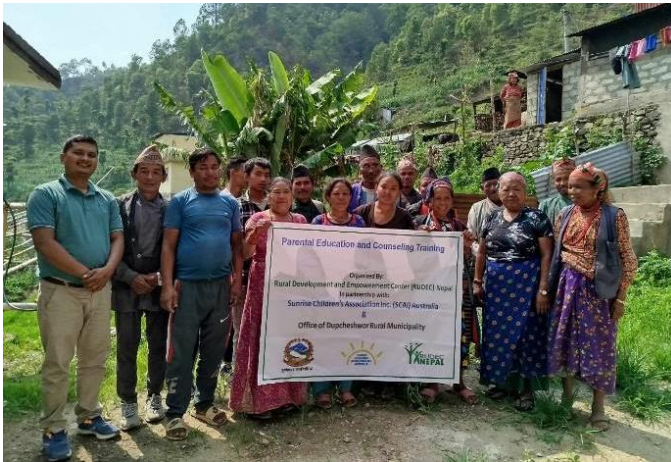
Above: Parental Education Training

23 guardians (12 men and 11 women) participated in this training from the Betini program. This training was organised with funding from the Dupcheshwor Rural Municipality office as part of government collaboration with our project and its activities.