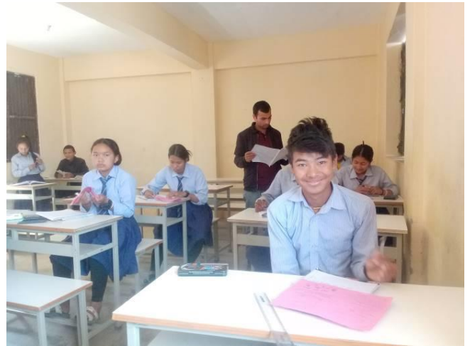
Above: Mahadev School visit