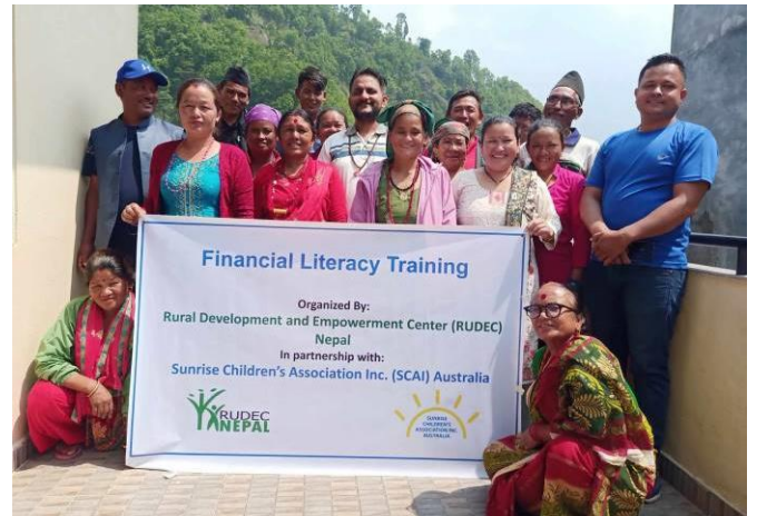
Above: Financial literacy training

Training focused on formulating effective business plans for the cooperative itself and for its associated members, effective collection of savings, and mobilisation of loans for the promotion of the livelihood of cooperative members.