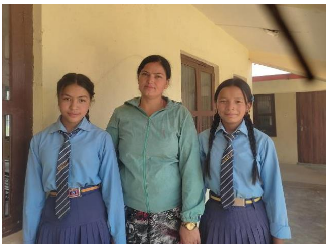
Above: Birendra School visit