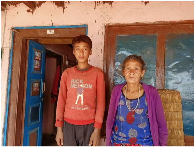
Above: Chirring with grandmother