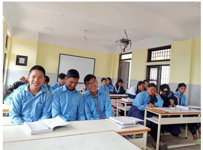
Above: Mangala School Visit