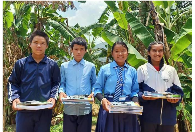
Above: Students from Mangaladevi School with educational materials

We distributed notebooks, pencils, and pens to 77 students out of 92 this quarter.