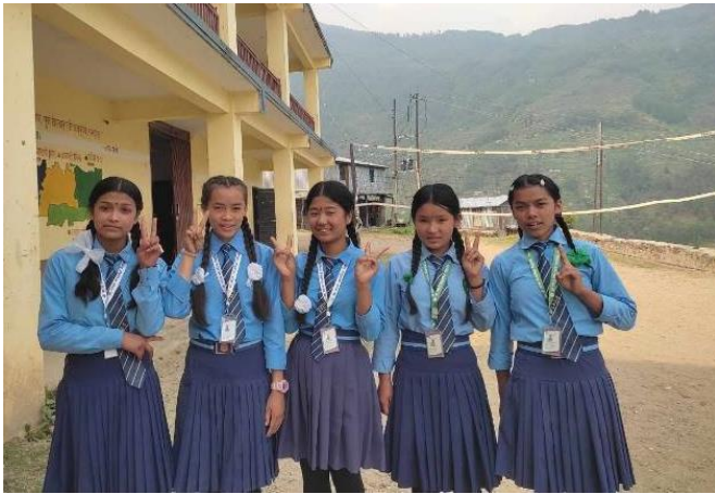
Above: Maphle School Visit