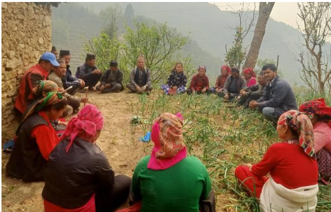
Above and below: Glimpses of Training

The training provided further information to guardians about how to improve their vegetable farming. A total of 21 (12 Men, 9 Women) guardians/parents attended the training from Betini program.