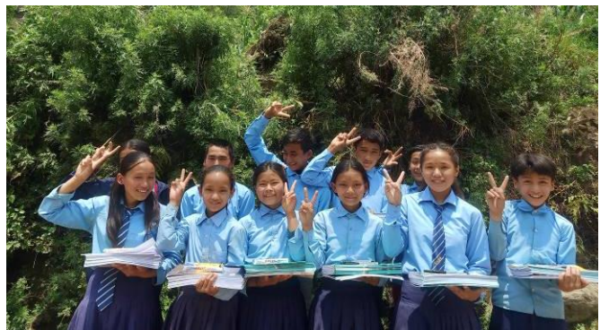
Above: Students with education materials from Maphle and Birendra SS