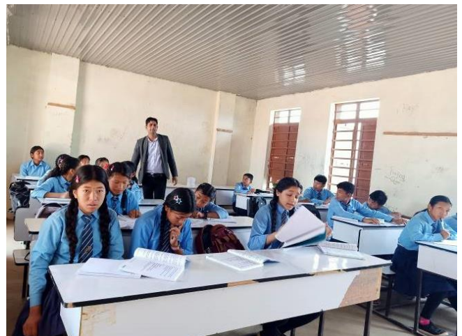
Above: Visit to the Udayjalpa School