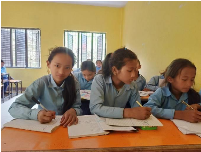
Above: Arjun School Visit