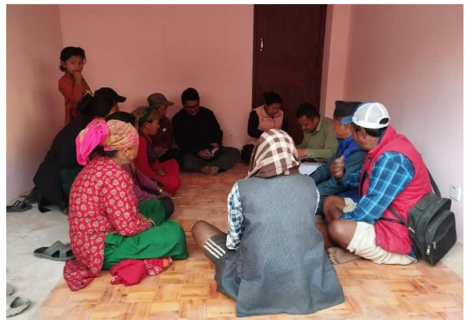
Above: Cooperative Meeting, Sangini