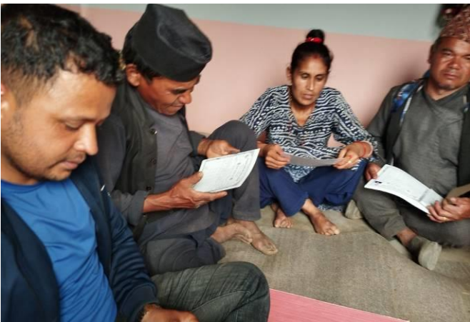
Above: Cooperative Meeting, Kaukeshori