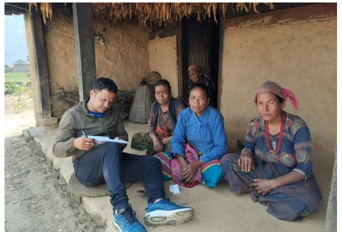
Above: Cooperative Meeting, Jimnang