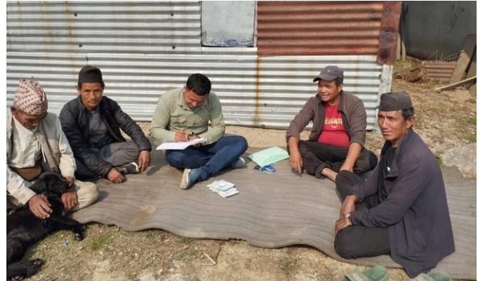
Above: Cooperative Meeting, Golfu

Coop members attended their meetings in subgroups (similar to their earlier savings groups) monthly and deposited their savings regularly this quarter.