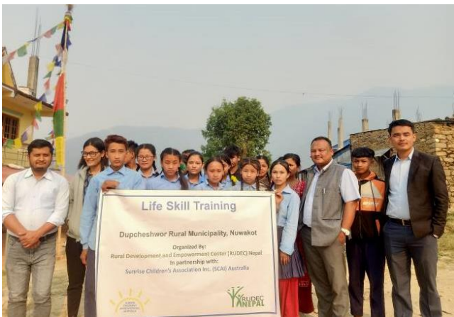
Above: Life Skill Training

32 youth (18 girls and 14 boys) participated in this training from the Betini program.