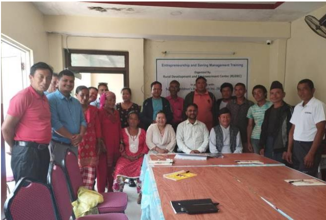
Above: Entrepreneurship and Saving Management Training