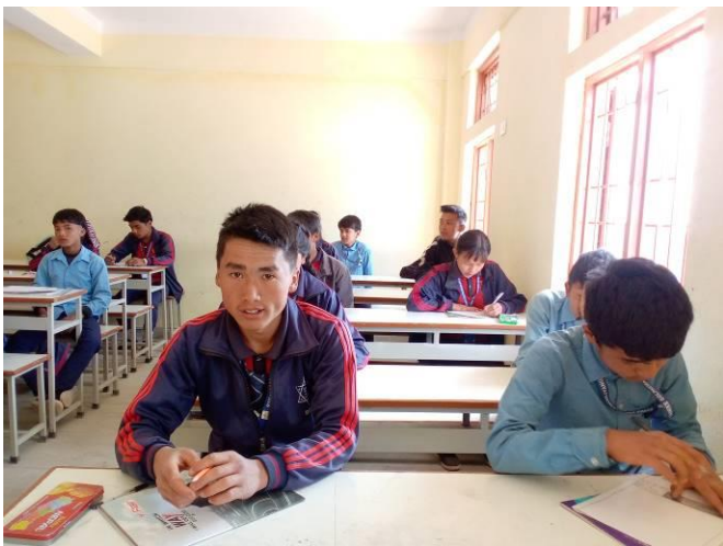
Above: Golfubhanjyang School Visit