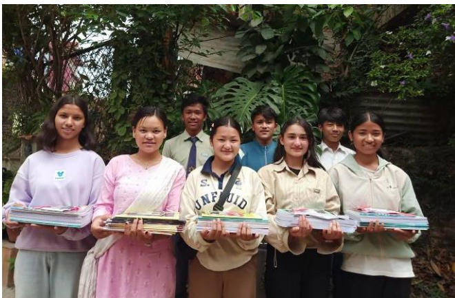
Above: Students with educational materials from Kathmandu