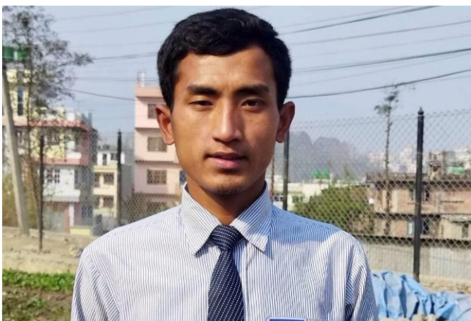
Above: Milan, 1st div