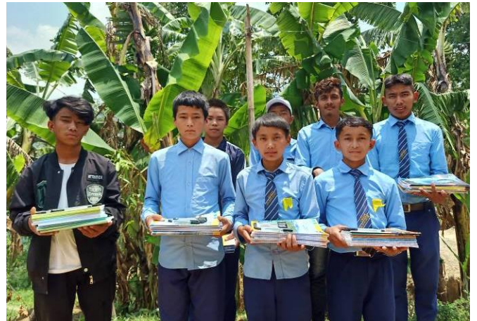
Above: Students with education materials from Mangala School